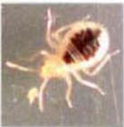
A BED BUG ADULT AFTER A BLOOD MEAL

Adult bed bugs are brown to reddish-brown, oval-shaped, flattened, and about 3/16 to 3/8 inch long. Their flat shape enables them to readily hide in cracks and crevices. The body becomes more elongated, swollen, and dark red after a blood meal.