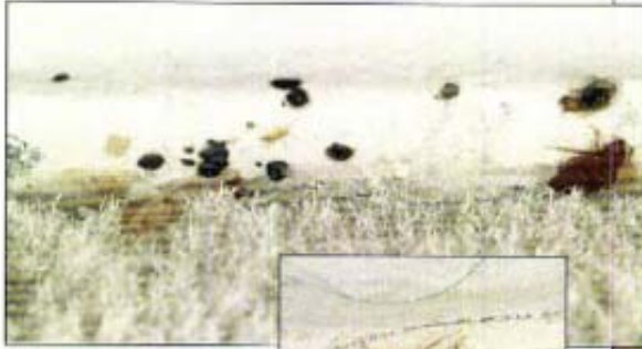
(Right) Bed bugs often hide along the edges of carpeting. A pest management professional performing an inspection. (Above) A close up of bed bug eggs, nymphs and adults.