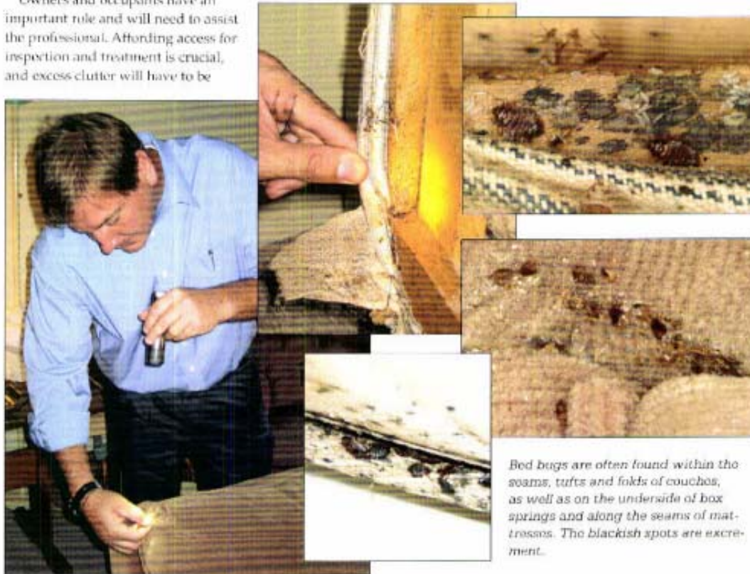
Bed bugs are often found within the seams, tufts and folds of couches, as well as on the underside of box springs and along the seams of mattresses. The blackish spots are excrement.

Infested and infestation-prone bedding and garments will need to be bagged and laundered (120°F minimum) since these items cannot be treated with insecticides. Another option is to place clothing, toys, shoes, backpacks, etc., in a clothes dryer set at medium to high heat for 10 to 20 minutes. This will kill all bed bug life stages and can be done alone or in conjunction with laundering. Items which cannot be put in a washer or dryer can sometimes be de-infested by wrapping in plastic and placing them outdoors in a hot, sunny location for at least a day. If this method is attempted, packing fewer items per bag makes it harder for the bugs to find cooler places to hide.