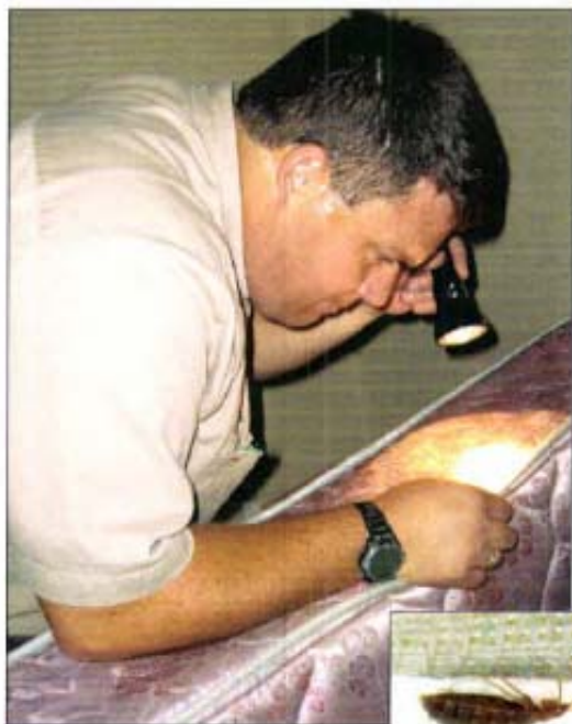
Bed bugs often congregate along the seams of mattresses.