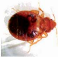
A BED BUG NYMPH