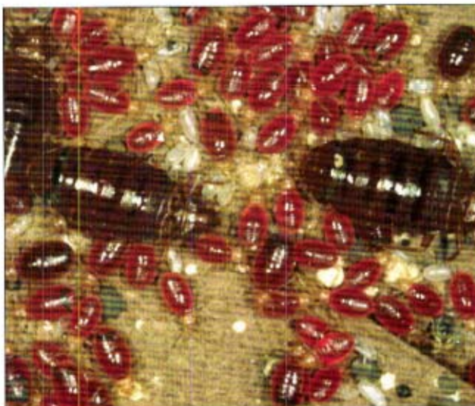
Adult bed bugs, young nymphs and eggs. Photo was taken just after feeding.

Most householders and business owners of this generation have never seen a bed bug. Until recently, they also were a rarity among pest management professionals. Bed bug infestations were common in the United States before World War II. But with improvements in hygiene, and especially the widespread use of DDT during the 1940s and '50s, the bugs all but vanished. The pests remained prevalent, however, in other regions of the world including Asia, Africa, and Eastern Europe. In recent years, bed bugs have also made a comeback in the U.S. They are increasingly being encountered in homes, apartments, hotels, motels, health care facilities, dormitories, shelters, schools, and modes of transport. Other places where bed bugs sometimes appear include movie theaters, laundries/dry cleaners, furniture rental outlets, and