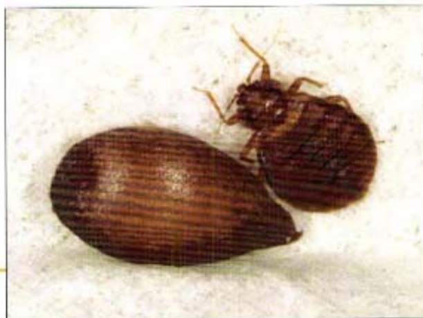
(Right) An adult bed bug is slightly smaller than an apple seed.

HOW INFESTATIONS BEGIN. It often seems that bed bugs arise from nowhere. The bugs are efficient hitchhikers