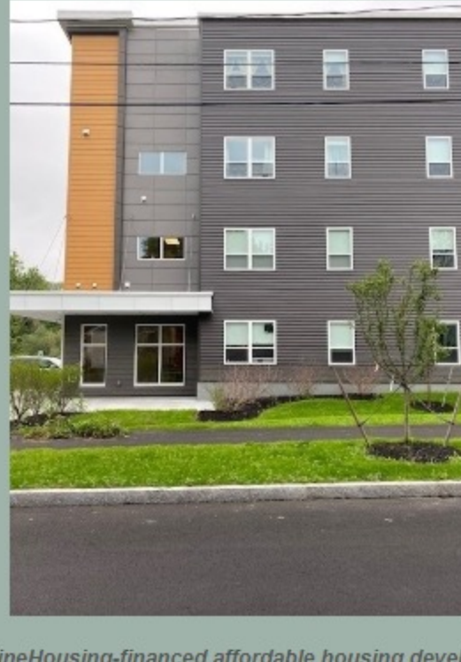
Wessex Woods in Portland, a MaineHousing-financed affordable housing development with 40 units, was one of 16 developments and 605 new units of housing that came on line in 2021.

All development data can be viewed on the development dashboard .