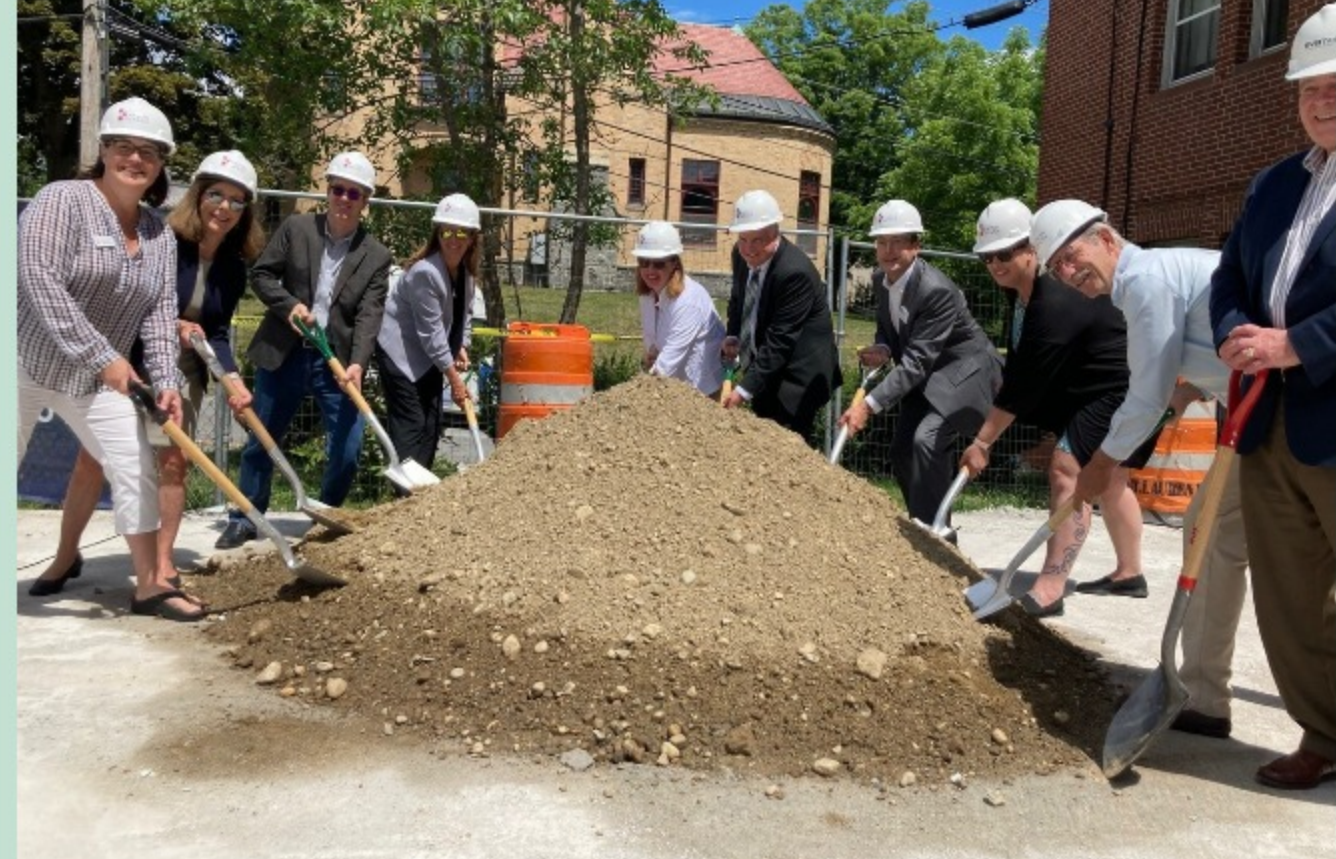
In June, MaineHousing joined the Bath Housing Authority and leaders from the Szanton Company in celebrating the groundbreaking of the Uptown development on the corner of Front and Summer Streets, which will create 50 new affordable housing units for older Mainers.